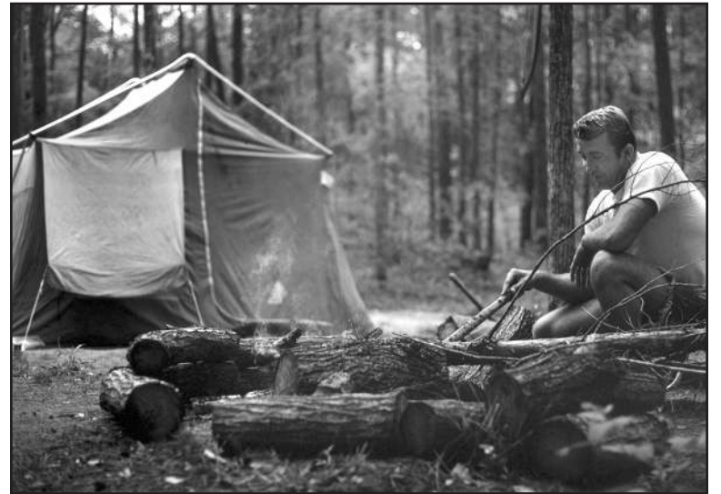
Campers are expected throughout the area this weekend.