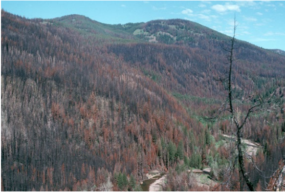
Fig. 2. Mixed-severity fires (fires that leave recognizable patches of low-severity, medium-severity, and high-severity effects) typify the majority of mixed-conifer forest systems in the western United States. The brown-needled and blackened areas harbor unique sets of plant and animal species found in no other forest conditions. This photograph of the North Fork of the Blackfoot River was taken 10 months after the 1988 Canyon Creek fire in Montana. Many fire-dependent plant and animal species were present in the more severely burned areas until they were helicopter logged, suggesting that unburned forests might be a better alternative for timber harvest.