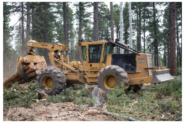
Log loader working on a timber sale.

• The primary reason for the increase in acreage is the current policy does not require the exclusion of areas that may be uneconomical to harvest.